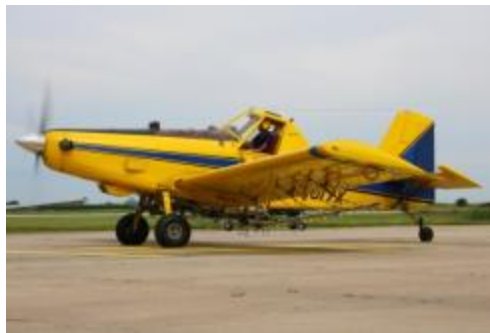
Figure 2. AT402B aircraft

'Duster 2' and 'Duster 3' were Air Tractor (AT) 402Bs, a low-wing, turbine-engine agricultural aircraft with a 400-gallon capacity and working speed of 120-140 mph. See figure 2.