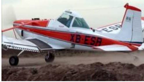
Figure 1. Cessna T188C Husky

'Duster 2' and 'Duster 3' were Air Tractor (AT) 402Bs, a low-wing, turbine-engine agricultural aircraft with a 400-gallon capacity and working speed of 120-140 mph. See figure 2.