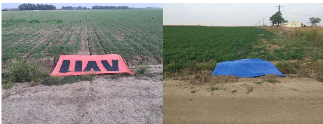
Figure 5. Ground markings

Fields D and E were unmanned with no airborne UAS. Each had prototype ground crew markings, consisting of an orange tarp with 'UAV' printed in large black letters, along with a blue tarp laid flat on the ground to make the work site more visible. See figure 5.