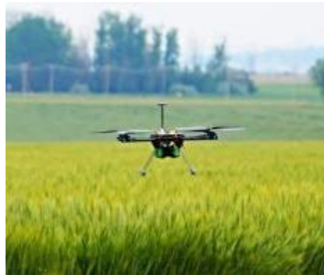
Figure 4. Agribotix Enduro

The Agribotix Enduro was a multi-rotor platform with a rotor-to-rotor span of 2.3 ft (28 inches), weight of 6 lbs, and cruise speed of 30 mph. The aircraft was dark in color. The platform was designed for long-endurance, precision agriculture operations, such as infrared imaging. The aircraft could be flown by a laptop or by an operator using a radio-control transmitter. See figure 4.