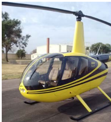
Figure 3. R44 helicopter

'Duster 4' was a Robinson R44, a piston-engine, light utility helicopter with a maximum gross weight of 2,500 lbs and a maximum cruise speed of approximately 130 mph. See figure 3.